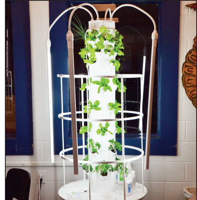
One of the hydroponic garden towers donated by Lake Chatuge Rotary to Towns County Schools to grow vegetables for cafeteria consumption.

From a cost standpoint, Bradshaw said it is less expensive to hire GMASS to do this